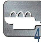
4 Stern Drive Lower Unit