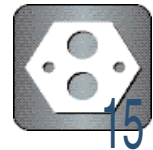
15 Seals & Gaskets

Watercraft, engine, and components must be purchased as a package at the time of sale.