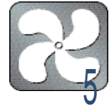
5 Closed Cooling System