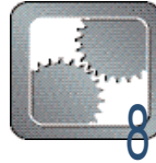
8 Intermediate Housing (Stern Drive only)