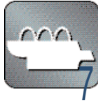
7 Stern Drive Upper Gear Housing