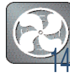
14 Jet Drive