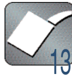
13 Oil Injection System