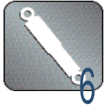
6 Power Trim