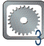
3 V-Drive (Stern Drive and InBoard only)