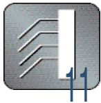
11 Fuel System