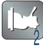
2 Transmission (Stern Drive and InBoard only)